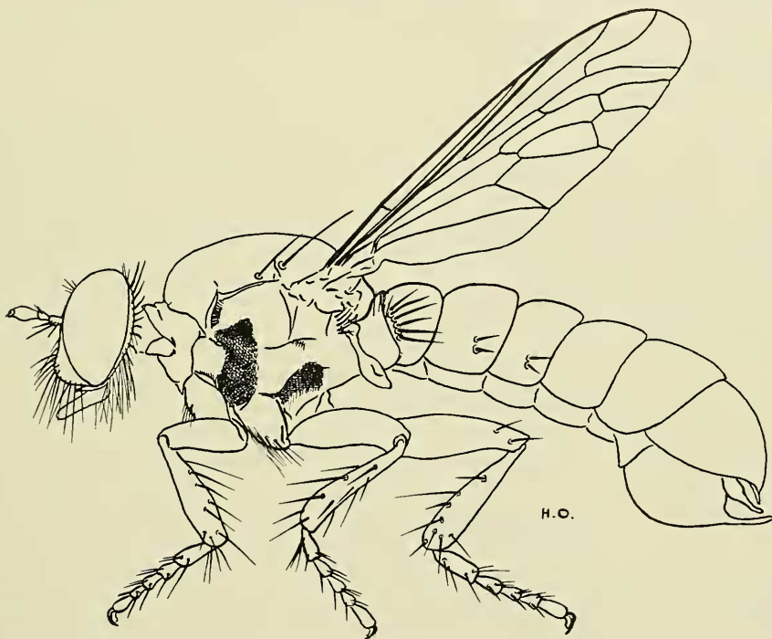
Fig. 1. Psilocurus translatus n. sp., ♂.

Head: Covered with white tomentum, leaving a bare shining black stripe vertically above antennae. Hairs and bristles of head mostly white, but with strong black occipital bristles, and some black hairs on frons and in upper part of mystax. Face prominent